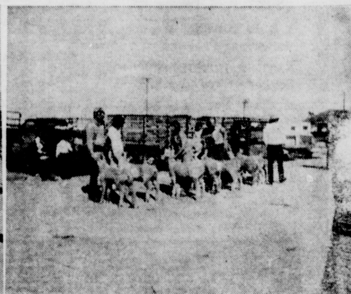
THIRD YEAR AND ABOVE FEEDERS