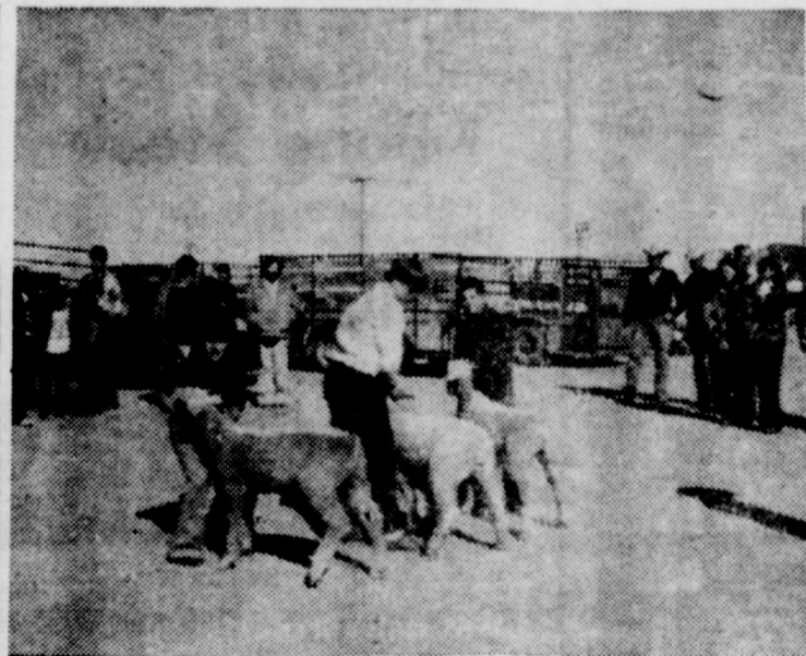
FIRST YEAR FEEDERS