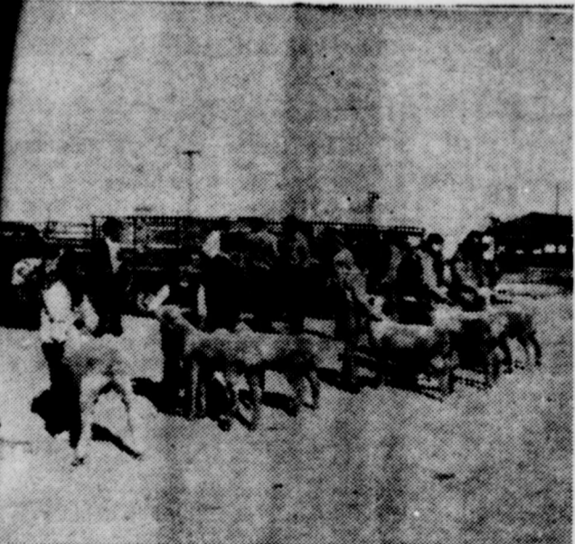
SECOND AND THIRD YEAR FEEDERS