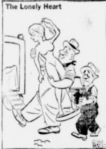
The Lonely Heart