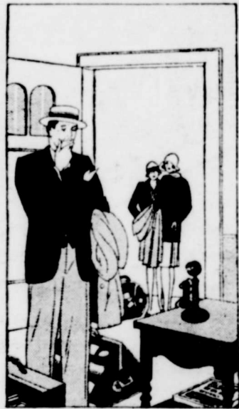
"Something should be done about this."

If you wish, while you are away we will refer your calls to another telephone—that of relatives, for instance.