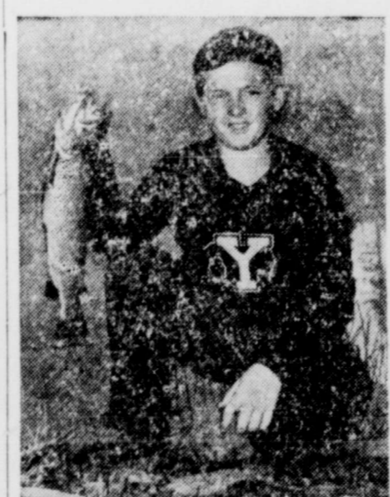
RIGHTLY PROUD . . . This chubby Tar Heel has just caught a trout. He used a hook, pole and worm in the Linville river in North Carolina.

Paul Green's story of the "Lost Colony" is an historical rendering of his version of the fate of the colonists. But it has within it all the elements of romance, of strife, of tender passion, of final tragedy in a new land.