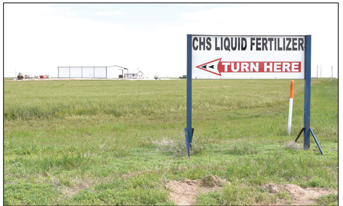
New CHS warehouse & office just east of current CHS plant, southwest of Friona.

CHS is a leading agribusiness owned by farmers, ranchers and cooperatives across the United States. Diversified in energy, grains and foods, CHS is committed to helping its customers, farmer-owners and other stakeholders grow their businesses through its domestic and global operations. CHS supplies energy, crop nutrients, grain marketing services, animal feed, food and food ingredients, along with business solutions including financial and risk management services. The company operates petroleum refineries/pipelines and manufactures, markets and distributes Cenex® brand refined fuels, lubricants, propane and renewable energy products.