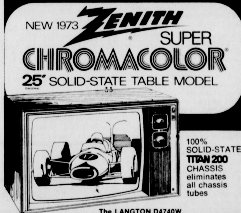
The LANGTON D4740W

Grained Walnut color metal cabinet. Super Chromacolor Picture—brighter than the famous original Zenith Chromacolor tube. 100% Solid-State Titan 200 Chassis. One-Button Tuning. AFC.