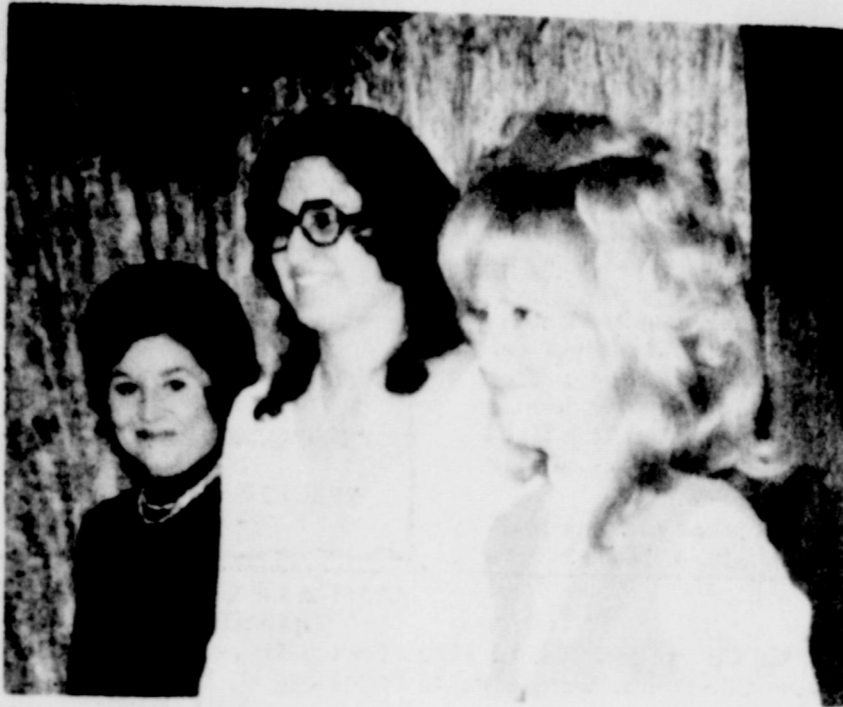
U.T.U. Auxiliary Has 14 Members Present