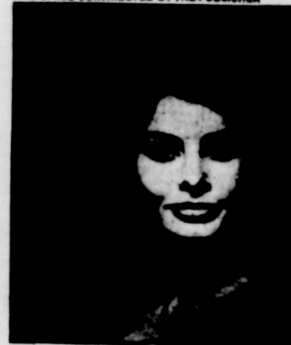
Miss Sophia Loren

Learn cancer's warning signals. You'll be in good company.