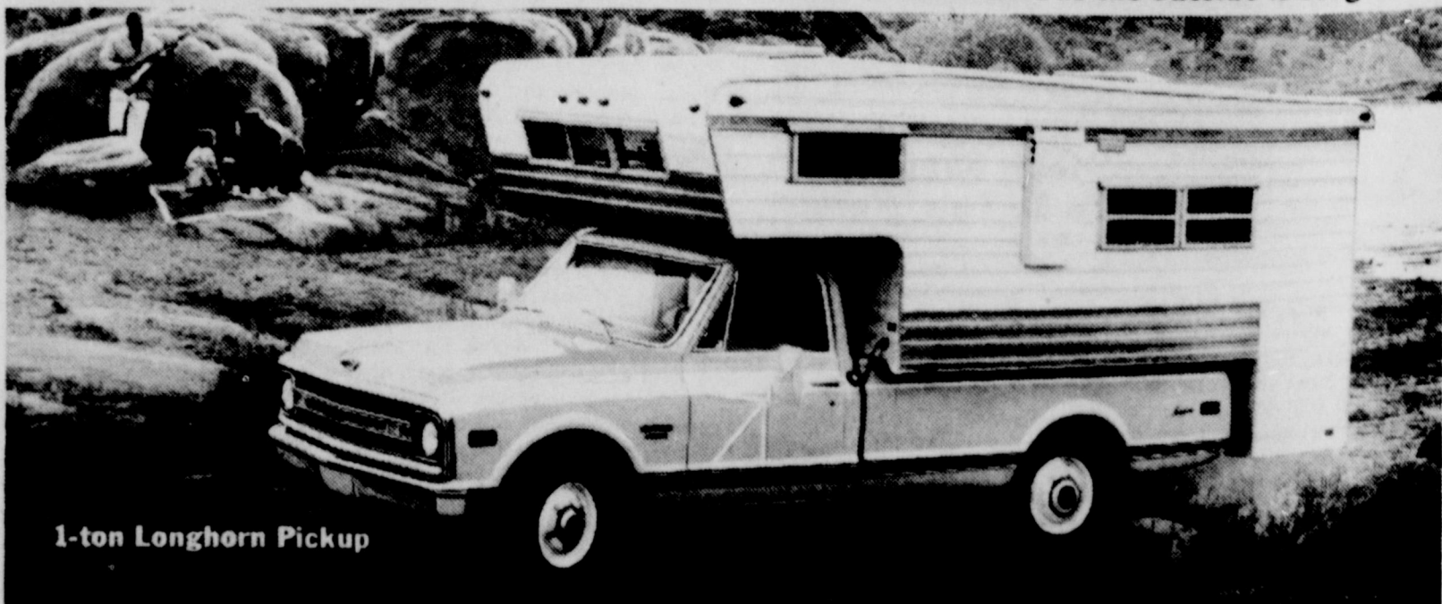
1-ton Longhorn Pickup

An inside as soft as the outside is tough.