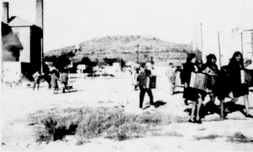
Students of the Sanderson Junior High School are shown in the beginning of their move Tuesday morning from the old red brick building to the new facility just south of the St. James Catholic Church. As the picture fades at the left, so fades the old building into the past.

Everyone who had anything to do with any part of the planning and completion of the building can be justly proud of whatever part they had in it because it is a fine building and one of which we can all be proud.