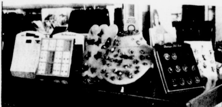
Seven displays of scatter pins - only a part of our costume jewelry department - are shown in the picture to give Christmas shoppers an idea of the wide choice of merchandise we have available in our store. We invite you to come in and look around and see for yourself. Kerr's is the one-stop mall for all of your shopping needs and our "fair-trade" prices will please you. adv.