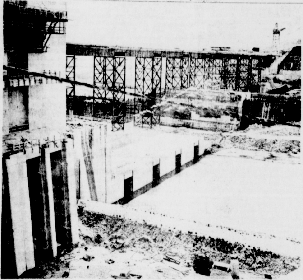
DAM INTAKE—Upstream side of Amistad Dam, under construction astride the Rio Grande 12 miles northwest of Del Rio, can be seen in detail from the new observation post being readied by the International Boundary Commission. Upper right shows the Mexican side of the structure. The crane carrying concrete moves along the trestle. Size may be gauged by the truck, at bottom of picture.