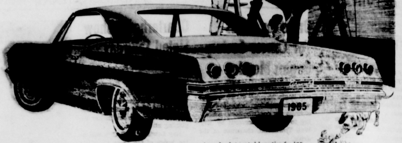
Chevrolet Impala Super Sport Coupe—one of two bucket-seated beauties for '65.