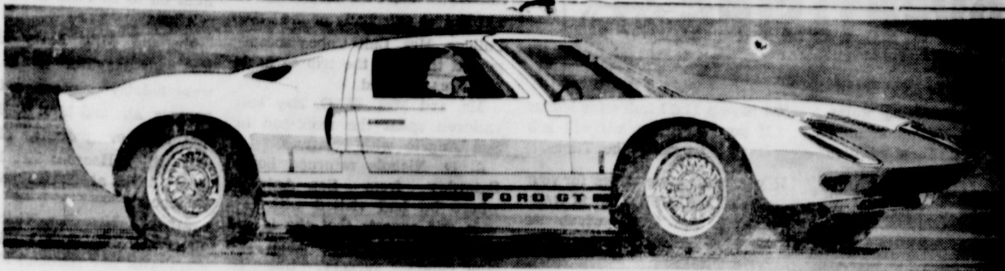
Above: Ford GT—a laboratory on wheels—helps tell us how to build better cars for you. Out-ran, outlasted Europe's finest entries in two 12-