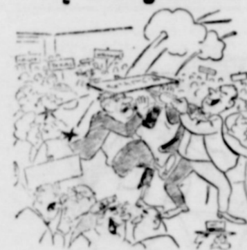
"Please, I'm not a candidate!"