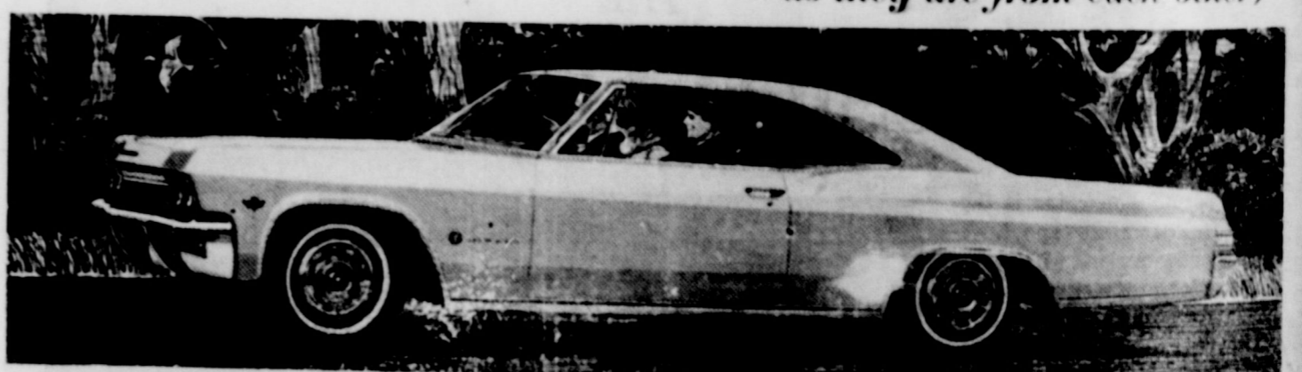
CHEVROLET - As roomy a car as Chevrolet's ever built. Chevrolet Impala Sport Coupe

When you take in everything, there's more room inside this car than in any Chevrolet as far back as they go. It's wider this year and the attractively curved windows help to give you more shoulder room. The engine's been moved forward to give you more foot room. So, besides the way a '65 Chevrolet looks and rides, we now have one more reason to ask you: What do you get by paying more for a car - except bigger monthly payments?