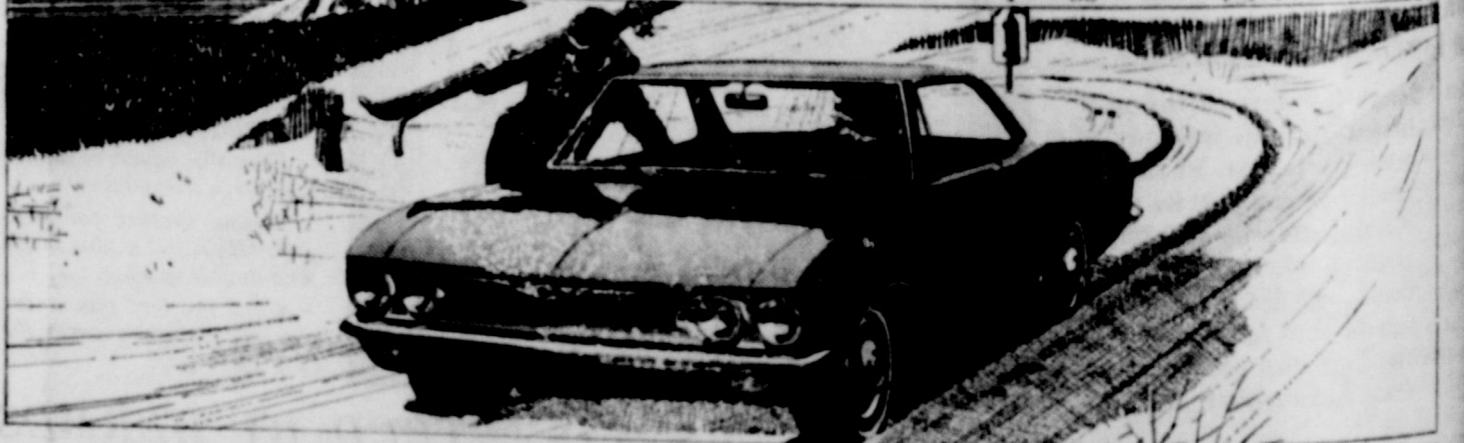
CORVAIR - The only rear engine American car made. Corvair Corsa Sport Coupe

When you take in everything, there's more room inside this car than in any Chevrolet as far back as they go. It's wider this year and the attractively curved windows help to give you more shoulder room. The engine's been moved forward to give you more foot room. So, besides the way a '65 Chevrolet looks and rides, we now have one more reason to ask you: What do you get by paying more for a car - except bigger monthly payments?