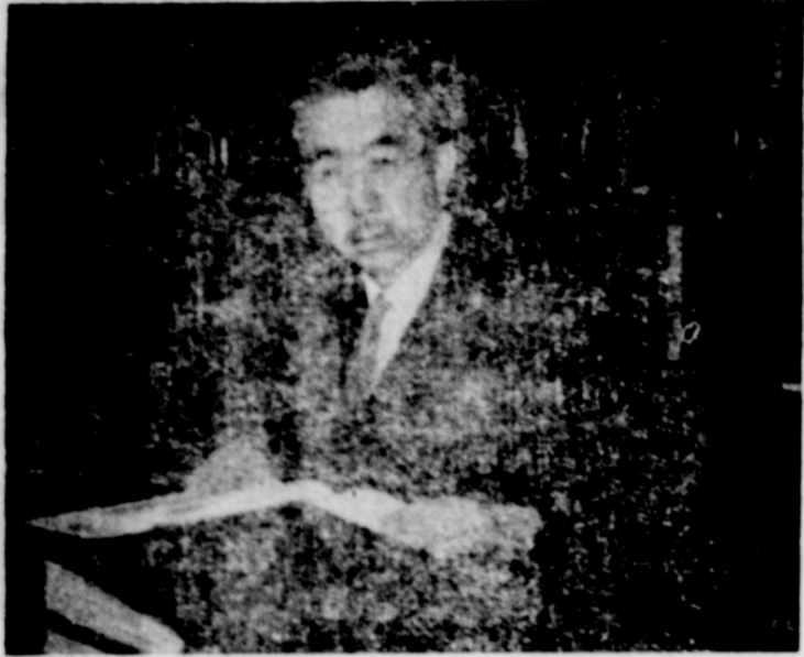
His Majesty Emperor Hirohito of Japan, celebrated his 62nd birthday on April 29. The Imperial birthday is the principal holiday in Japan today. His Majesty studied at the Peers' School and at a special institute established for his education. After a six-month visit to Europe in 1921, he became Prince Regent and married Empress Nagako in 1924. Upon the demise of the Emperor Taisho in 1926, His Majesty succeeded to the Throne as the 124th in the line of the Imperial Dynasty of Japan. His formal accession took place in 1928. His Majesty is noted as a devoted student of marine biology and has published a number of books on his discovery of new species.