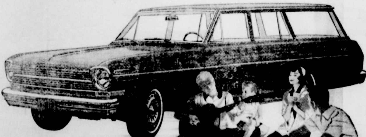
NEW CHEVY II NOVA STATION WAGON Here's a wagon that sells at a compact price, yet totes in a big way with a longer load floor than any compact—over 9 ft. with second seat and tailgate down.

See the new Chevrolet, Chevy II and Corvair at your Chevrolet dealer's One-Stop Shopping Center.