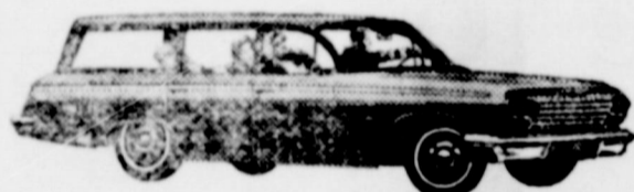
NEW BEL AIR 4-DOOR STATION WAGON Jet-smoothie that rides just right, loaded or light—with 97.5-cu.-ft. cargo care and Full Coil suspension.

NOW FUN AND SUN DAYS AT YOUR CHEVROLET DEALER'S