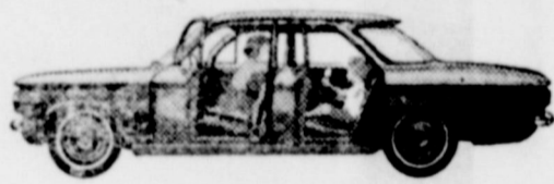
CORVAIR MONZA 4-DOOR SEDAN From snappy interiors to sure-footed seat, this one's got the gift of making sport of most any trip.