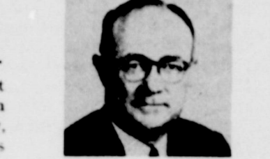
"Working for Texas"

PRESTON SMITH for LIEUTENANT GOVERNOR of Texas