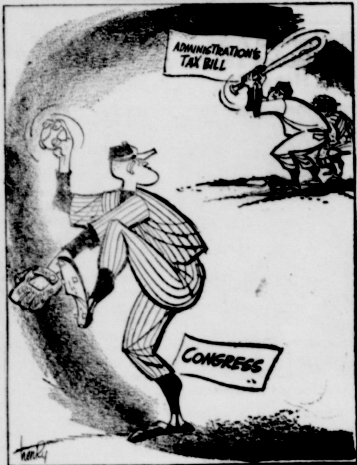
THE CRUCIAL BALL GAME

Almost any day now, the Administration's tax bill for 1963 "goes to bat" in the House of Representatives.