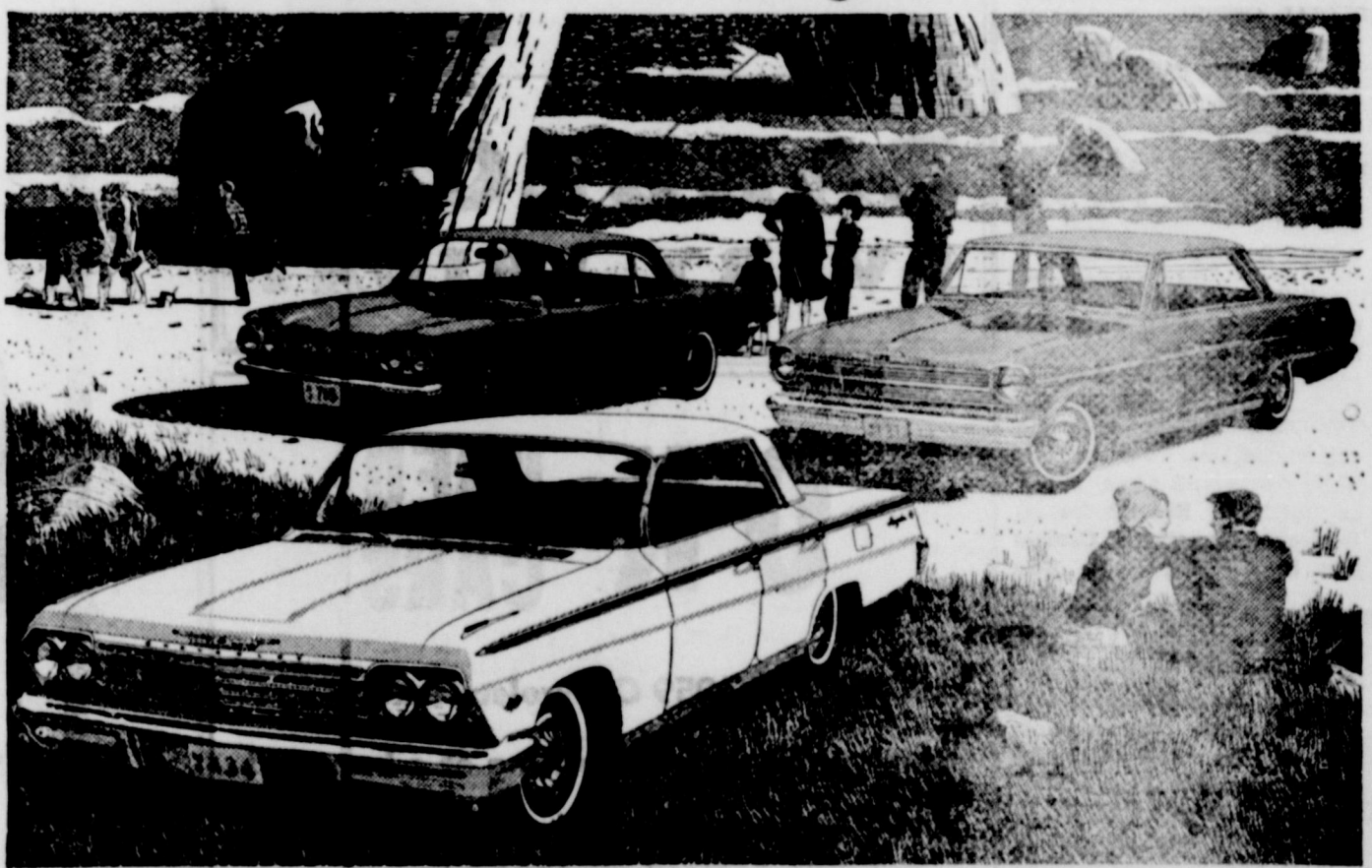
CHEVROLET IMPALA Room, refinement and riding comfort. Foreground, the Impala Sport Sedan. CORVAIR MONZA Sports Car spice without a sports car price. At rear is the Monza Club Coupe. CHEVY II NOVA The frisky family-sized Chevrolet with a low, low price tag. Above right, Nova Sport Coupe.

Like your driving sporty, with quicksilver steering, flat-as-a-pancake cornering, sure-footed traction? Then a Corvaire Monza's for you. Or maybe the new-size Chevy II is more to your liking. Built for big families and still slips neatly into small parking places. And, with this, the kind of ingenious engineering (new easy-riding Mono-Plate rear springs, for example) that