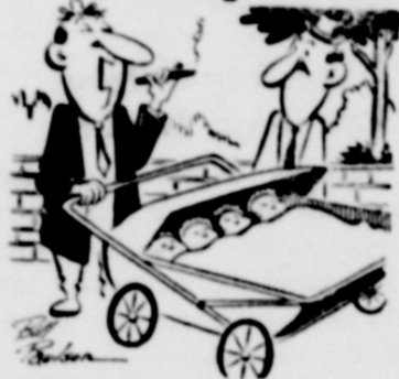
"It's 'planned parenthood.' We plan to take advantage of very tax deduction the law allows!"