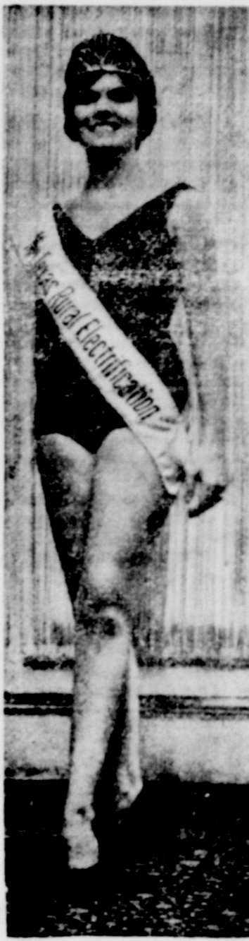
BORDER BEAUTY is new Miss Texas Rural Electrification, selected from seven finalists during statewide Texas Electric Cooperatives, Inc. annual meeting in San Antonio last week.