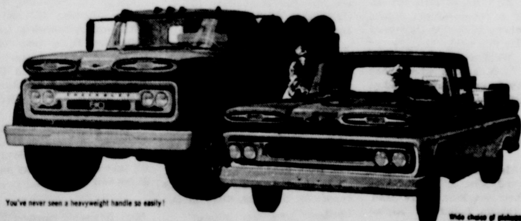
You've never seen a heavyweight handle so easily!