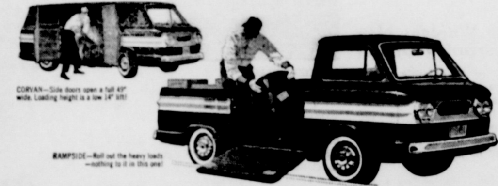
CORVAIR—Side doors open a full 47" wide. Loading height is a low 24" 5/8!"

DUDLEY'S TEXACO STATION —Your FIRESTONE Dealer—