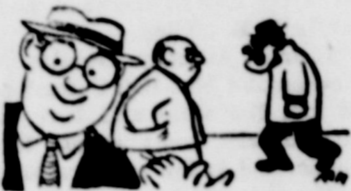
"The heaviest load any man ever carries on his back is packing a grudge."