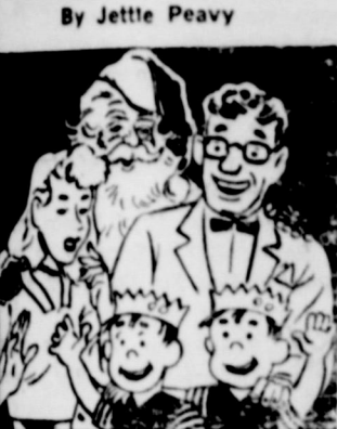
MERRY CHRISTMAS FROM ALL OF US TO EACH OF YOU!

PEAVY INSURANCE AGENCY Sure Today, Be Sure Tomorrow! DIAL DI 5-2211 SANDERSON