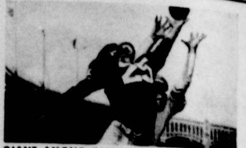
GIANT AMONG GIANTS. That's Dick Nolan, defensive backfield star of the N. Y. Giants. Nolan is a Camel smoker. He says he's borrowed other brands. But Camel is the cigarette he buys for complete smoking satisfaction.

Are you smoking more now but enjoying it less?