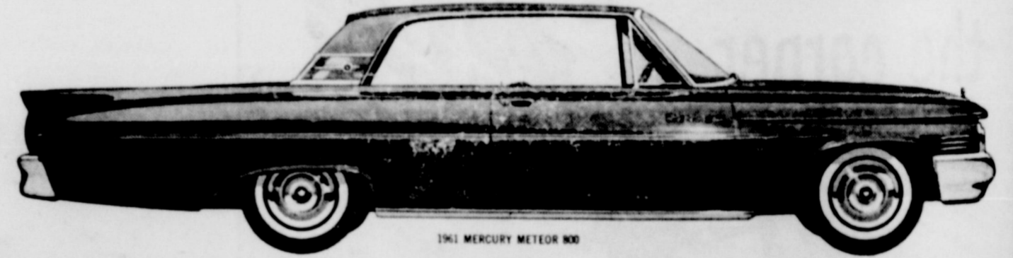
1961 MERCURY METEOR 800

Priced to compete with the low-price field! MERCURY METEOR 600 and 800 series