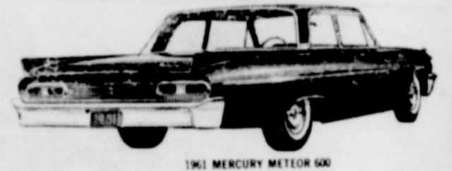
1961 MERCURY METEOR 800

Priced to compete with the low-price field! MERCURY METEOR 600 and 800 series