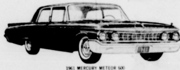
1961 MERCURY METEOR 600

Announcing a new and better kind of low-price car