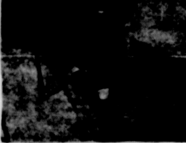
by Harold Kelley

Where there is fire there is not necessarily smoke. I'm passing that little gem of knowledge along just to let you know that old adages don't always hold true. If you want proof, here it is: Oil burners for furnaces are commonly thought of as messy, smelly, smoky and sometimes noisy things. But now along comes a new LENNOX oil burner that is the exception. Just in time, too, for the fuel oil people because other fuels have been increasing in popularity. This new burner makes oil competitive on a clean, quiet and economical basis. Maybe you are not the least bit interested in burning oil in your furnace. But whether you are or not, it is an example of how LENNOX has been ADVANCING THE SCIENCE OF HOME HEATING FOR 60 years. And that's a long time to be advancing anything. The LENNOX HI-PERFORMANCE oil burner is just the latest. There will be more in other fuels and in air conditioning, too. What I am trying to say is that whatever fuel you choose... oil, gas, electricity or coal... you can look to LENNOX for the latest and best. That goes for central air conditioning, too. By some strange coincidence, this LENNOX equipment I'm bragging about is sold and installed through our shop. Make us prove what we brag about.