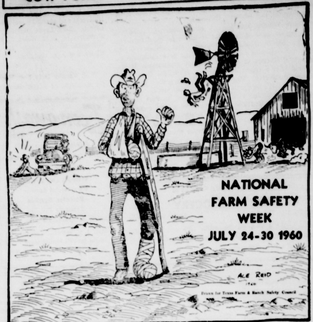
"If National Farm Safety Week doesn't git here soon there ain't gonna be none of us left to celebrate it!"