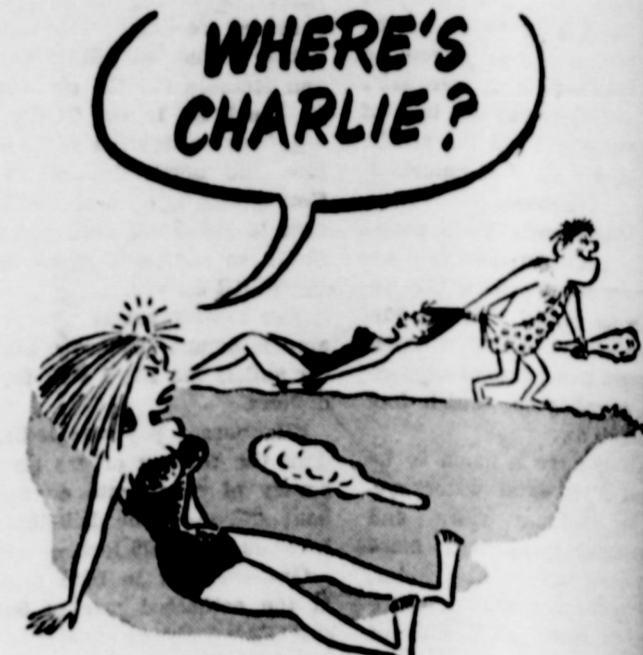
He's gone to order his wedding dinner at OASIS RESTAURANT so he won't get a knot on his head.