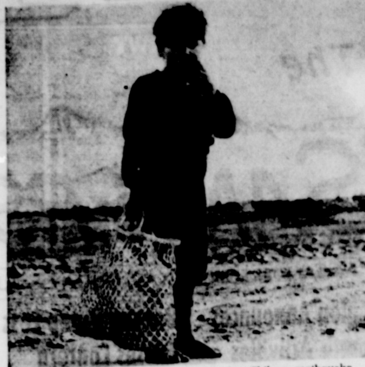
Dramatic proof of the need for aid for Chilean earthquake victims is evidenced by this Puerto Montt orphan—his only belongings heaped in a string bag—shown waiting a mercy plane trip to a refugee reception center in Santiago.

Nations throughout the world are responding to appeals for help. President Eisenhower appointed American Red Cross help. President Eisenhower appointed American Red Cross help. President Eisenhower appointed American Red Cross help.