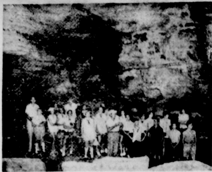
Vacationers escape heat in Longhorn Cavern where the temperature is a comfortable 64° the year 'round. Guided tours through the world's third largest cave are always the high spot of a trip to Texas' beautiful Highland Lakes area.