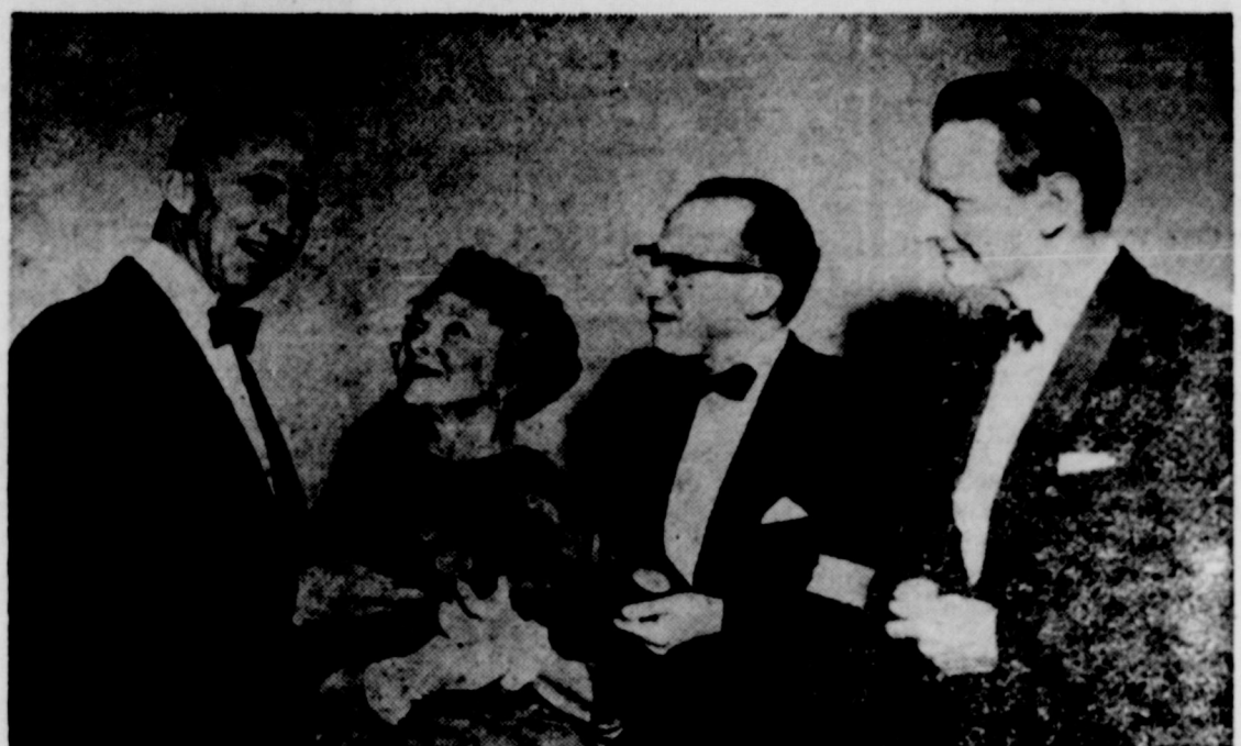
HUMANITARIANS HONORED — Frank Pace, Jr. (left), president of the National Institute of the Social Sciences, presents a Gold Medal Award to actress Helen Hayes, one of three recipients who were honored recently "for distinguished service to humanity" during the Institute's annual awards dinner at the Waldorf-Astoria Hotel. Looking on are Dr. Jonas Salk and Laurance Rockefeller, the other 1959 Gold Medal winners.