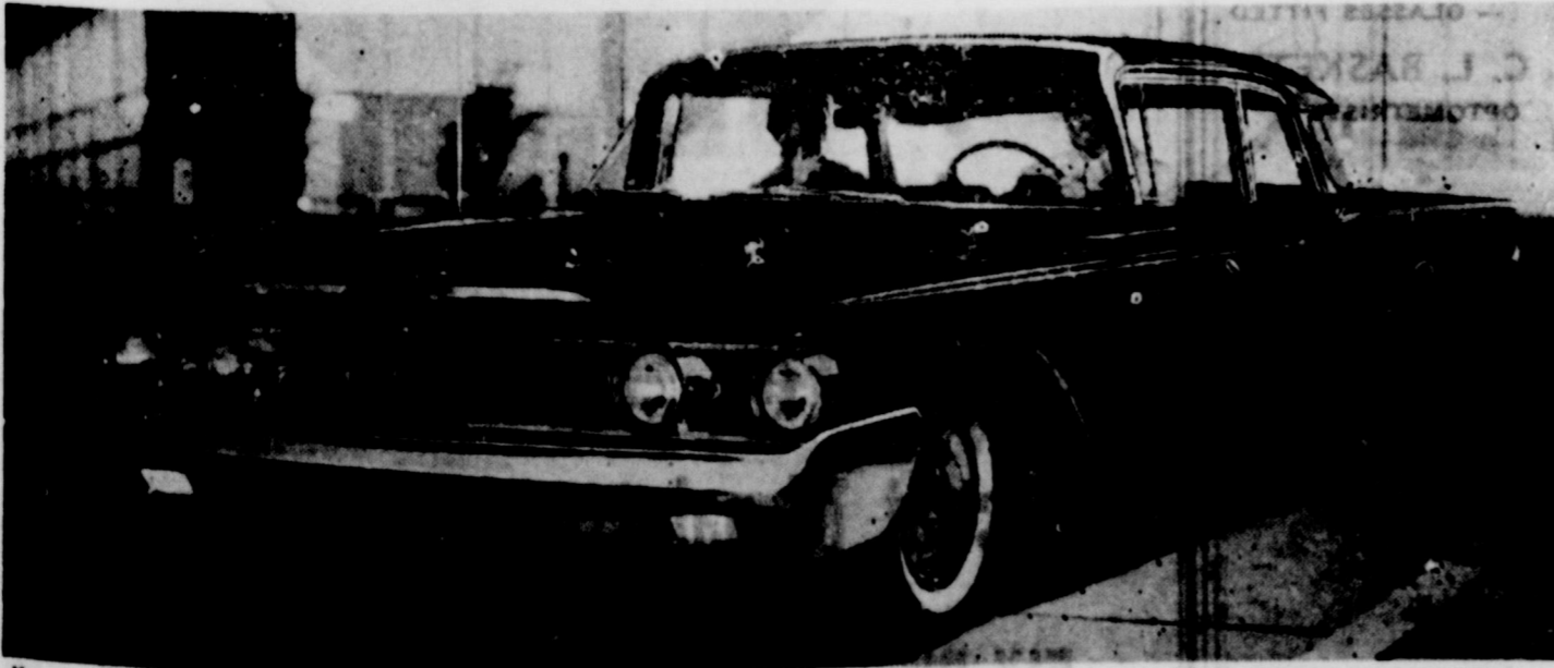
1960 Mercury Monterey 2-door Sedan with deluxe interior and complete carpeting of no extra cost.

THIS POPULAR MERCURY MONTEREY,* FOR EXAMPLE, IS NOW PRICED $136.00 LOWER THAN LAST YEAR