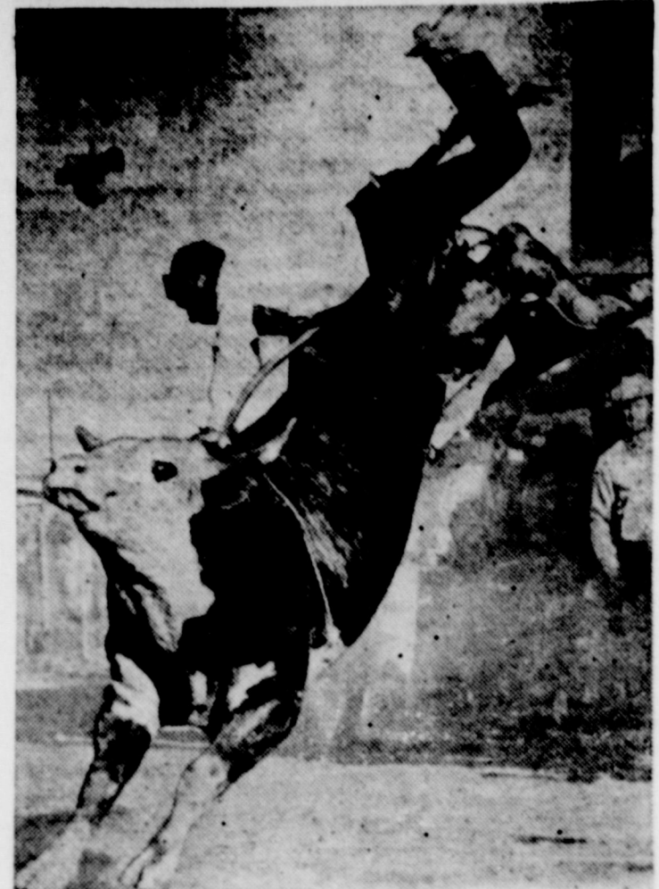
The roughest, toughest bucking broncos and bulls in America, like this one, will be pitted against the nation's top cowboys at the first National Finals Rodeo to be held in Dallas Dec. 26-30.