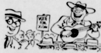
"The trouble with political jokes is that they often get elected to office."