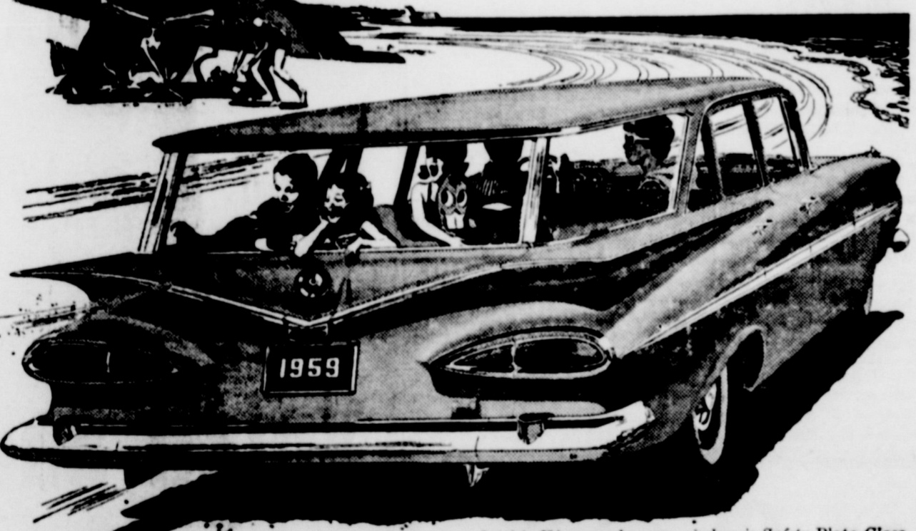
In this Kingwood, every window is Safety Plate Glass.

TOP TV—The Dinah Shore Chevy Show—Sunday—NBC-TV and the Pat Boone Chevy Showroom—weekly on ABC-TV.