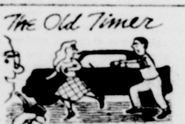
"The key to many a family row is the one that fits the car."