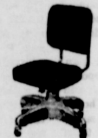
Model 18-T General Office Chair

Executive and secretarial seating completely adjustable for individual comfort, plus side chairs, conference chairs and folding chairs... all "Office fashioned" to look better and wear better than other chairs costing twice as much! Come in and see our complete selection... or call for a free ten-day trial in your office!