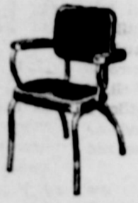
Model 20-LA Conference Chair