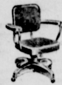
Model 18-TA Executive Posture Chair