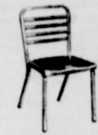
Model 22-L General Chair