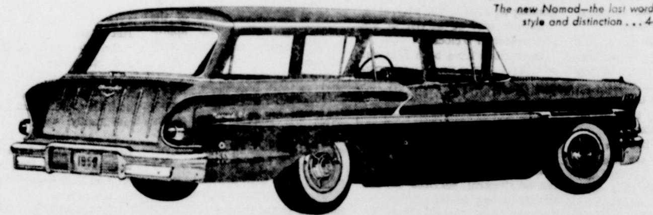
The new Nomad—the last word in station wagon style and distinction... 4-door 6-passenger

AIR CONDITIONING—TEMPERATURES MADE TO ORDER—AT NEW LOW COST. GET A DEMONSTRATION!