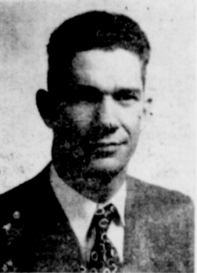
CALL ME BEFORE YOU BUY

Entering with her father, the bride wore a ballerina-length dress of white nylon eyelet over taffeta. Her dress was princess style with short sleeve and a V-shaped neckline. She wore gaunt-