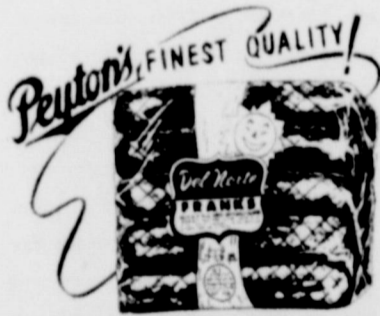
Peyton Del Norte FRANKS lb. 41c