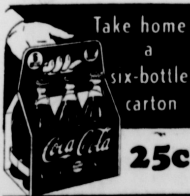
Take home a six-bottle carton Coca-Cola 25c