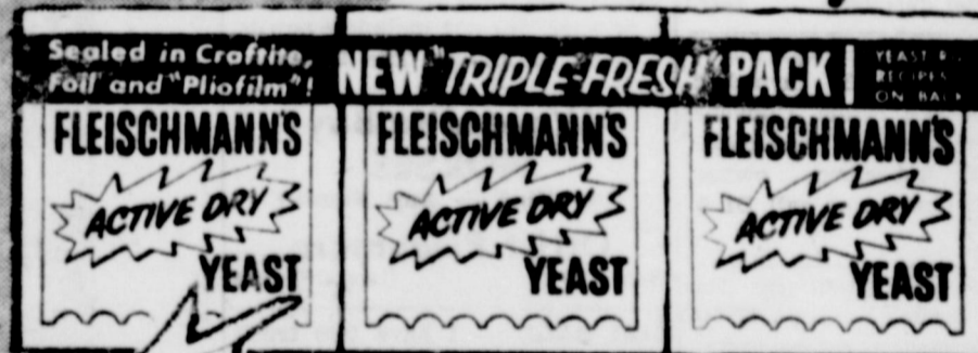
Another Fine Product of Standard Brands Inc.