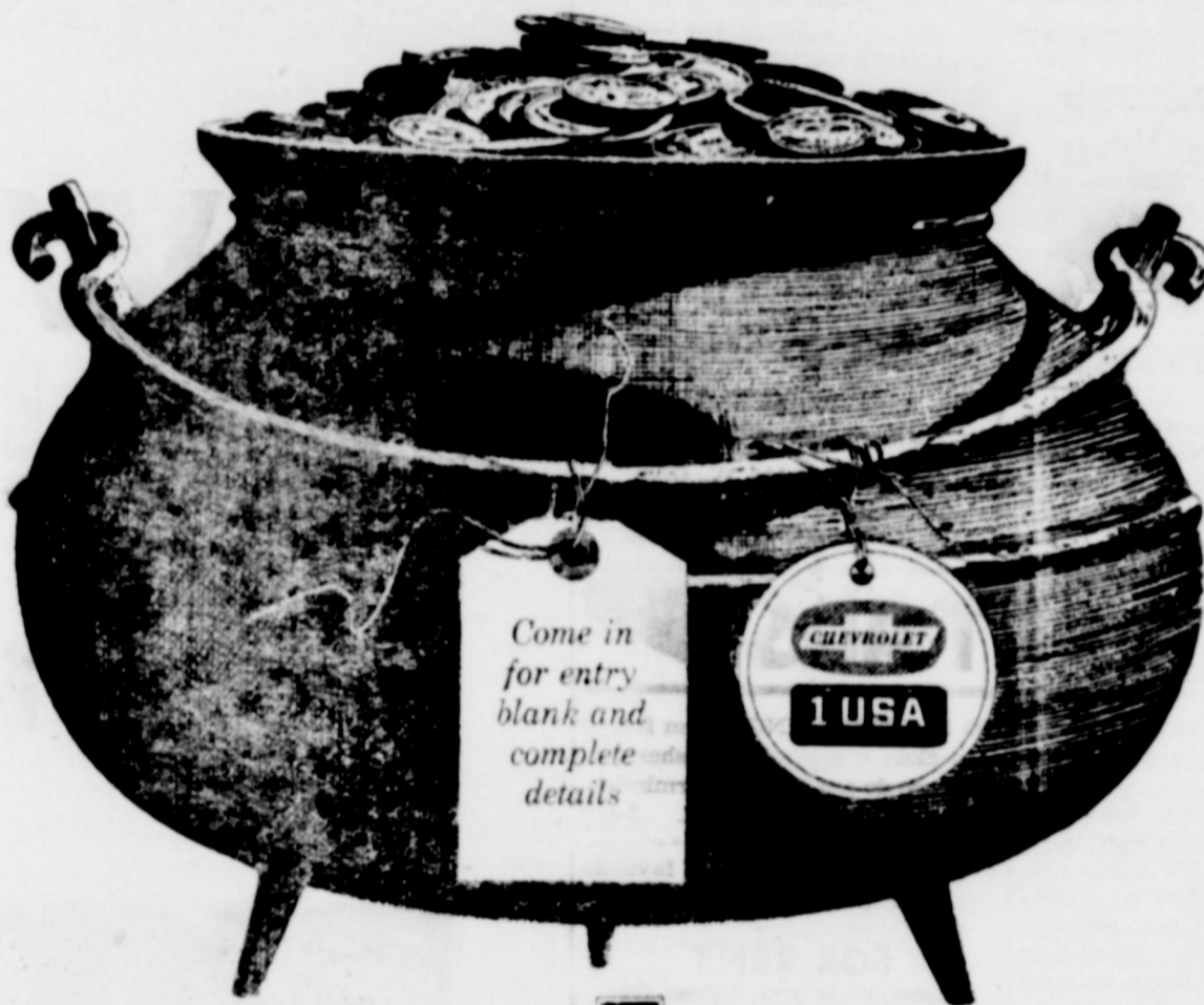
Only franchised Chevrolet dealers CHEVROLET display this famous trademark

Next 53 winners each get a '57 Chevrolet Bel Air 4-Door Sedan and a $500 vacation fund!