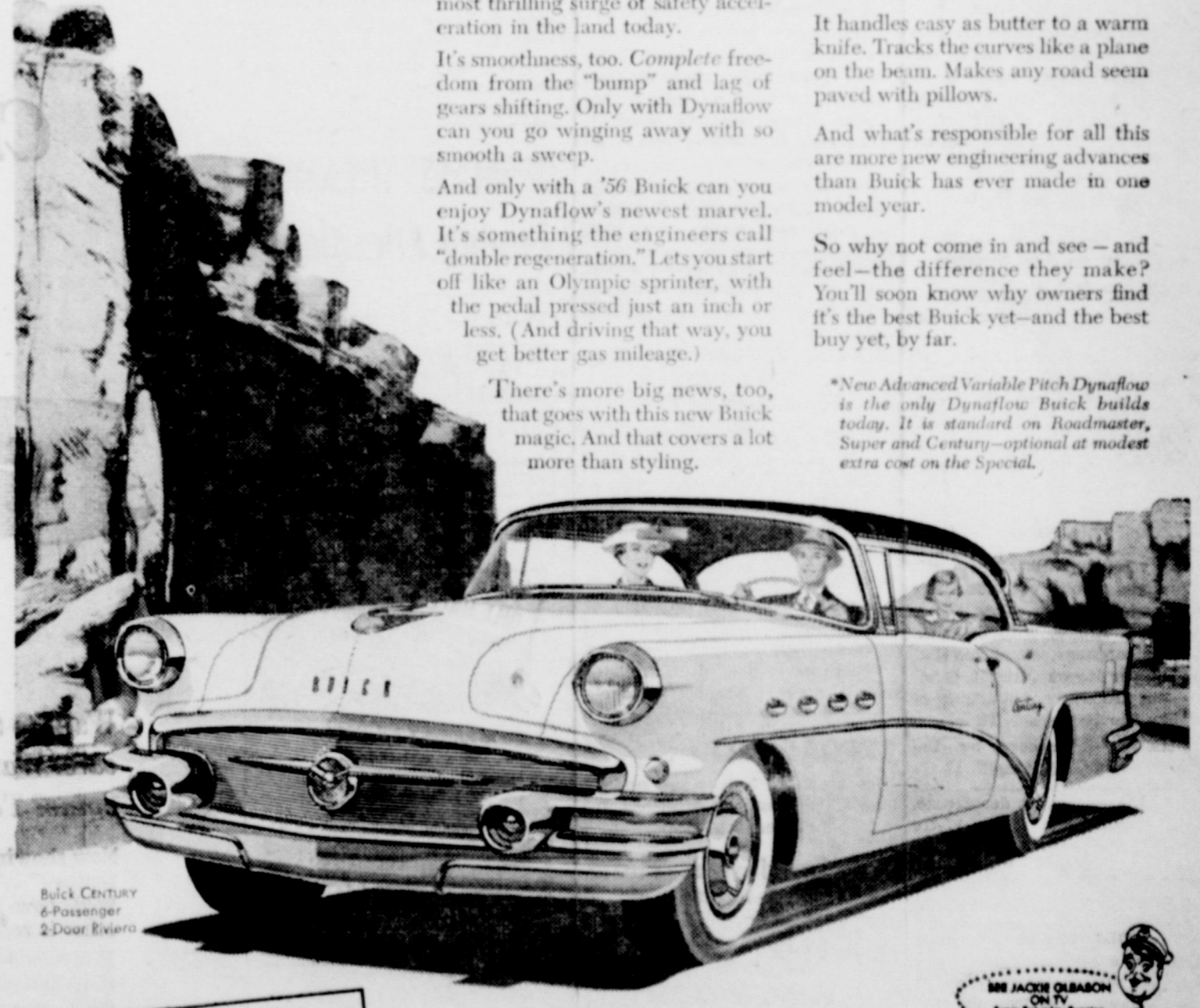
Buick Century 4-Door, 2-Door, Riviera

You'll see when you try Buick's new Variable Pitch Dynaflow!