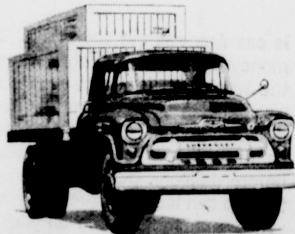
New Middleweight Champs

Meet today's most modern truck fleet! It offers new champs of every weight class, including four new heavy-duty series. It brings you new power for every job, with a modern short-stroke V8* for every model.