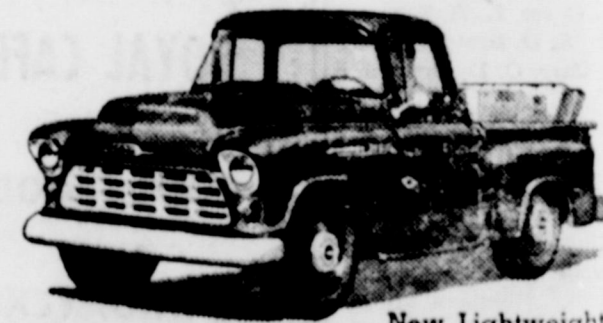
New Lightweight Champs

New models to do bigger jobs—rated up to 32,000 lbs. G.V.W.! New power right across the board—with a brand-new big V8 for high-tonnage hauling! New automatic and 5-speed transmissions!