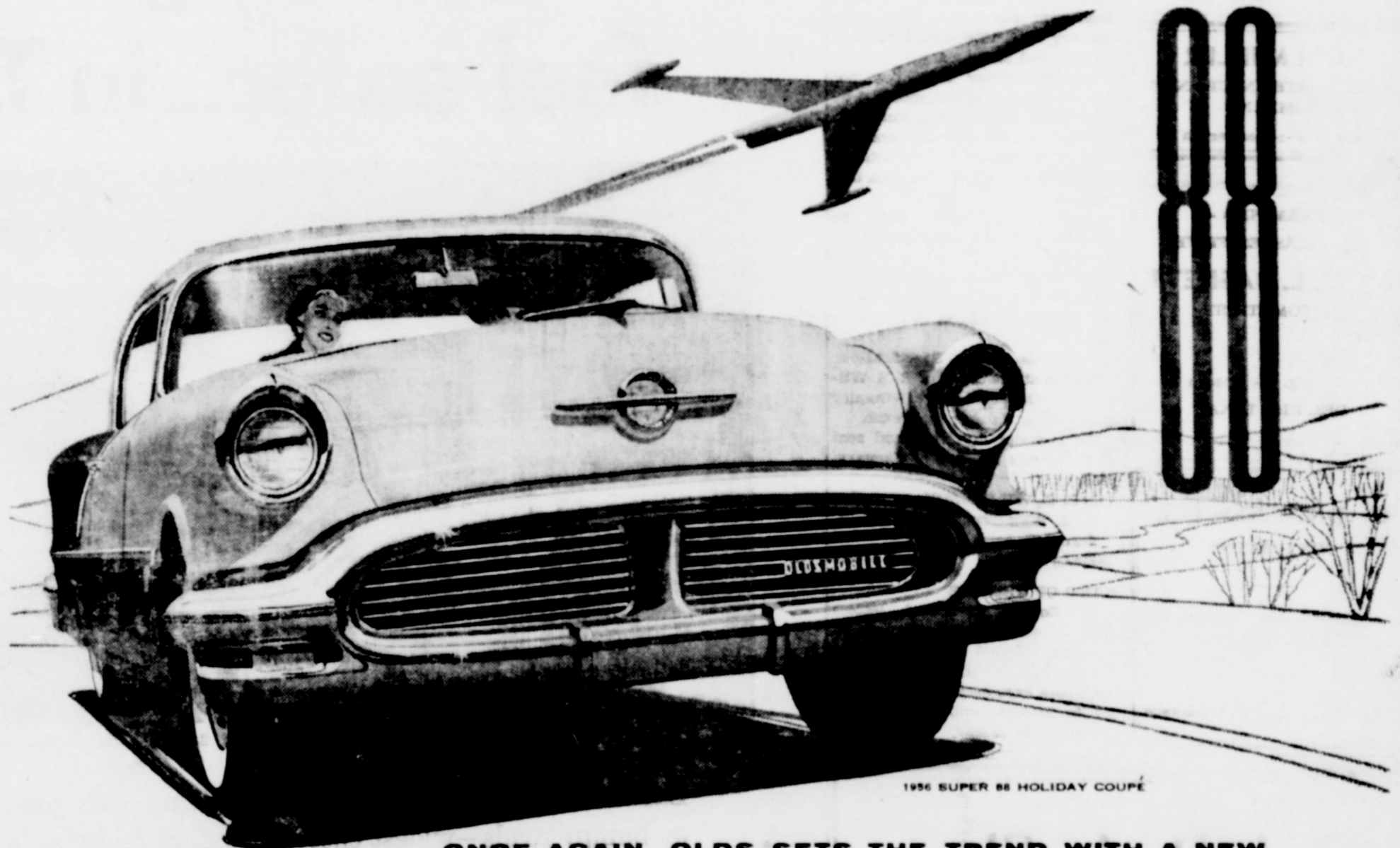
1956 SUPER 88 HOLIDAY COUPE