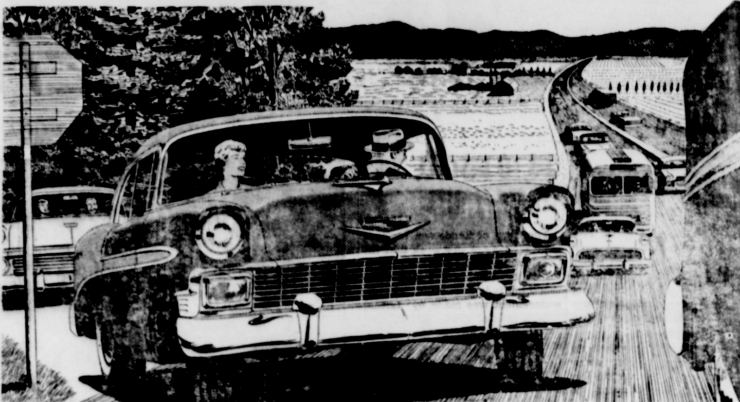
THE BEL AIR SPORT COUPE—one of 19 high-priced-looking Chevrolets, all with Body by Fisher.

Soft-spoken, yes. (One reason is the hydraulic-hushed valve lifters now in all Chevrolet engines—V8 or 6.) And this handsome traveler packs a horsepower wallop that ranges up to 205! It's charged with sheer, concentrated action.