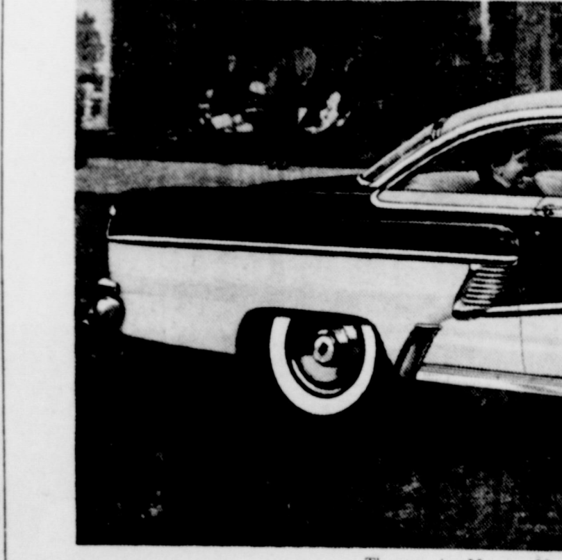
The stunning Mercury Montclair 2-door hardtop with distinctive low profile and Flo-Tone color styling.

Your driving is easier — you feel safer — in THE BIG M