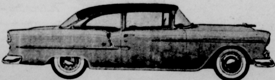
The Big Air 2-Door Sedan

There's the new "Blue-Flame 136" (teamed with Power-glide as an extra-cost option) and the new "Blue-Flame 125." Both bring you new, high-rated power—the zippy, thrifty high-compression kind. Both have new, more efficient cooling and lubrication systems... new engine mounts that result in almost unbelievable smoothness. And, like the new "Turbo-Fire V8," both are sparked by a new 12-volt electrical system. They're the liveliest, smoothest sixes Chevrolet ever put into a passenger car!