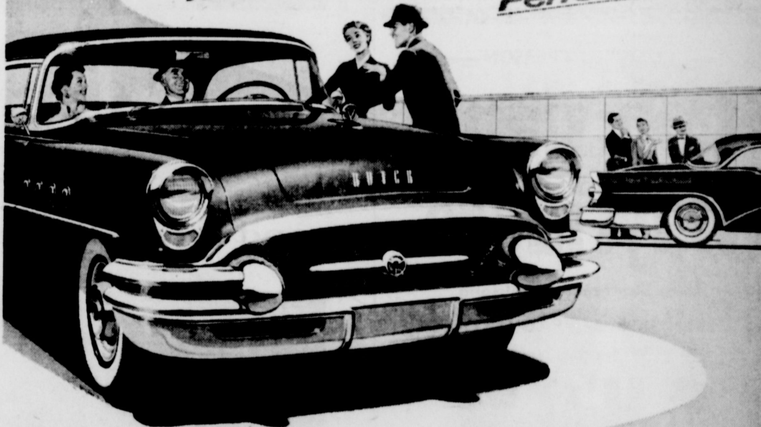
WHEN BETTER AUTOMOBILES ARE BUILT BUICK WILL BUILD THEM

New thriller in Style - Power - Performance