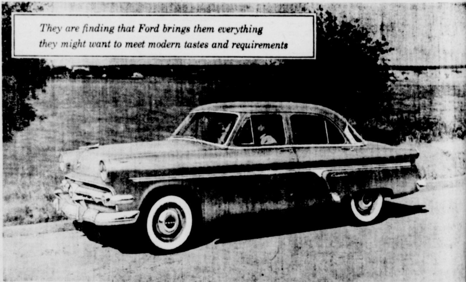
You can't buy better! It's the stunning Customline Fordor Sedan

They are finding that Ford brings them everything they might want to meet modern tastes and requirements