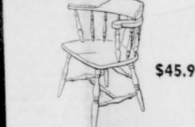
The Captain's Chair has the flavor of the Clipper Ship about its solid grace. $45.90