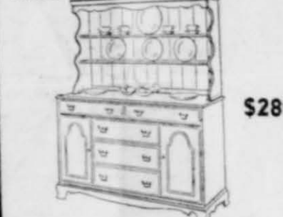
Side boards and hutches in many sizes combine colonial design with the extra storage space needed today. $289.90