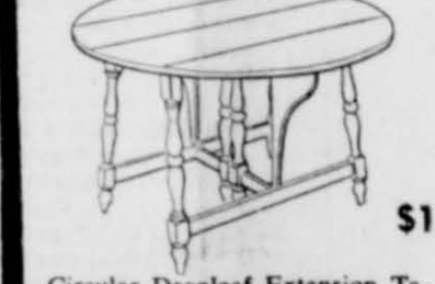
Circular Drop-leaf Extension Table saves space, yet opens to banquet size. 48 x 48, it extends to 48 x 64. $139.90