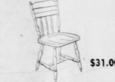
Side Chair—With the weight of solid maple, and the richness of Colony Arts own "Old Spice" finish. $31.00