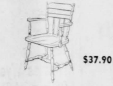
Armchair—An appealingly comfortable chair for double use—at table—or around the room. $37.90

Phone 134 WE TRADE FURNITURE Dimmitt, Texas