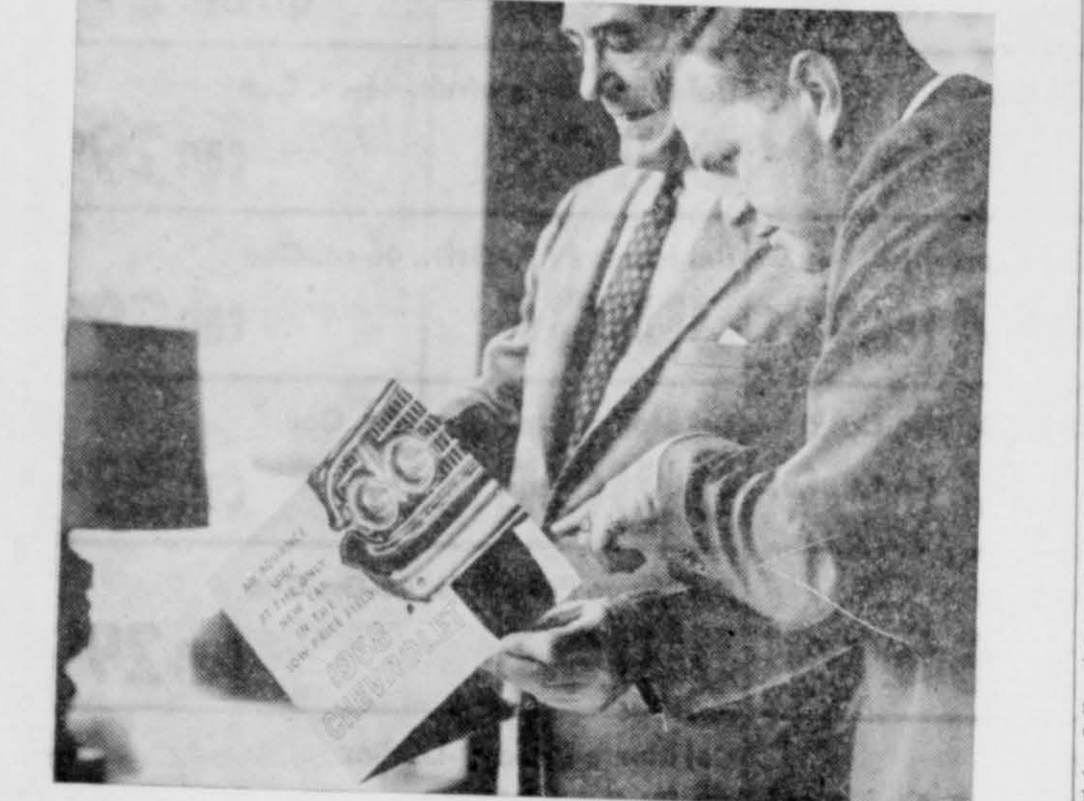
You can place your order now at Your Local Authorized Chevrolet Dealer's

Be our guest! COME IN AND LOOK AROUND OR WINDOW SHOP AT OUR EARLY AMERICAN FURNITURE SHOWING