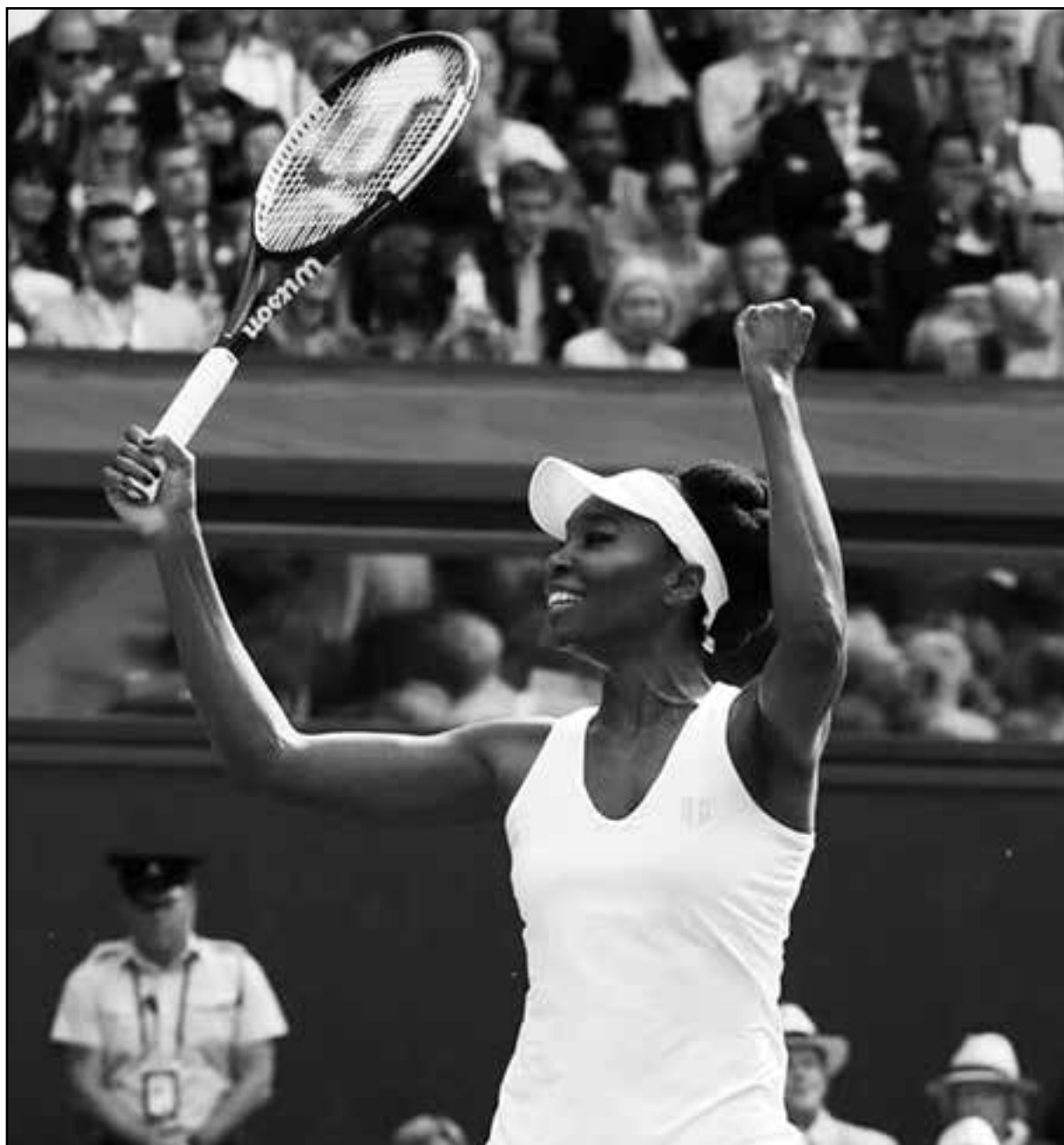
Venus Williams of the United States celebrates after beating Britain's Johanna Konta in their Women's Singles semifinal match on day nine at the Wimbledon Tennis Championships in London Thursday, July 13, 2017.