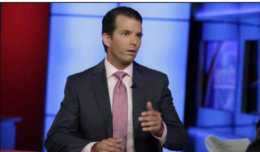
In this photo taken July 11, 2017, Donald Trump Jr. is interviewed by host Sean Hannity on his Fox News Channel television program, in New York.