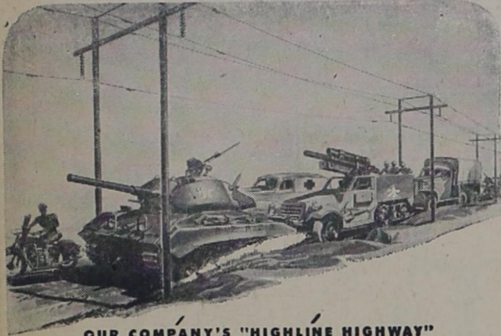
OUR COMPANY'S "HIGHLINE HIGHWAY" Vital to Victory

DENTIST Heard and Jones Building TULIA, TEXAS