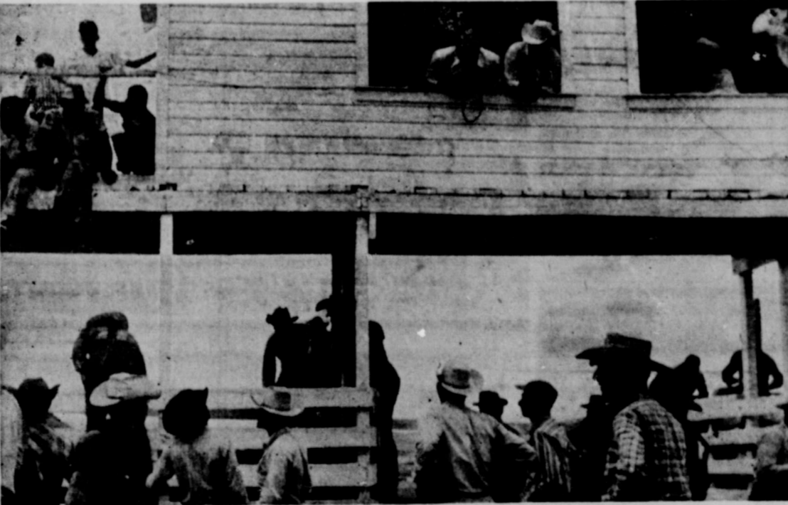
WHERE'S THE ACTION? — Had a little trouble here getting those onery Brahma bulls into the chutes and everyone was offering advice at the Roping Club's annual rodeo in Plains. The announcer was telling them how to handle things, but he didn't get out of the upstairs booth (said he didn't like animals).