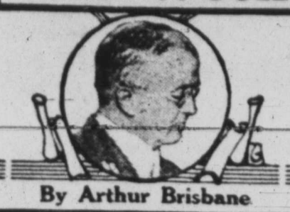
By Arthur Brisbane