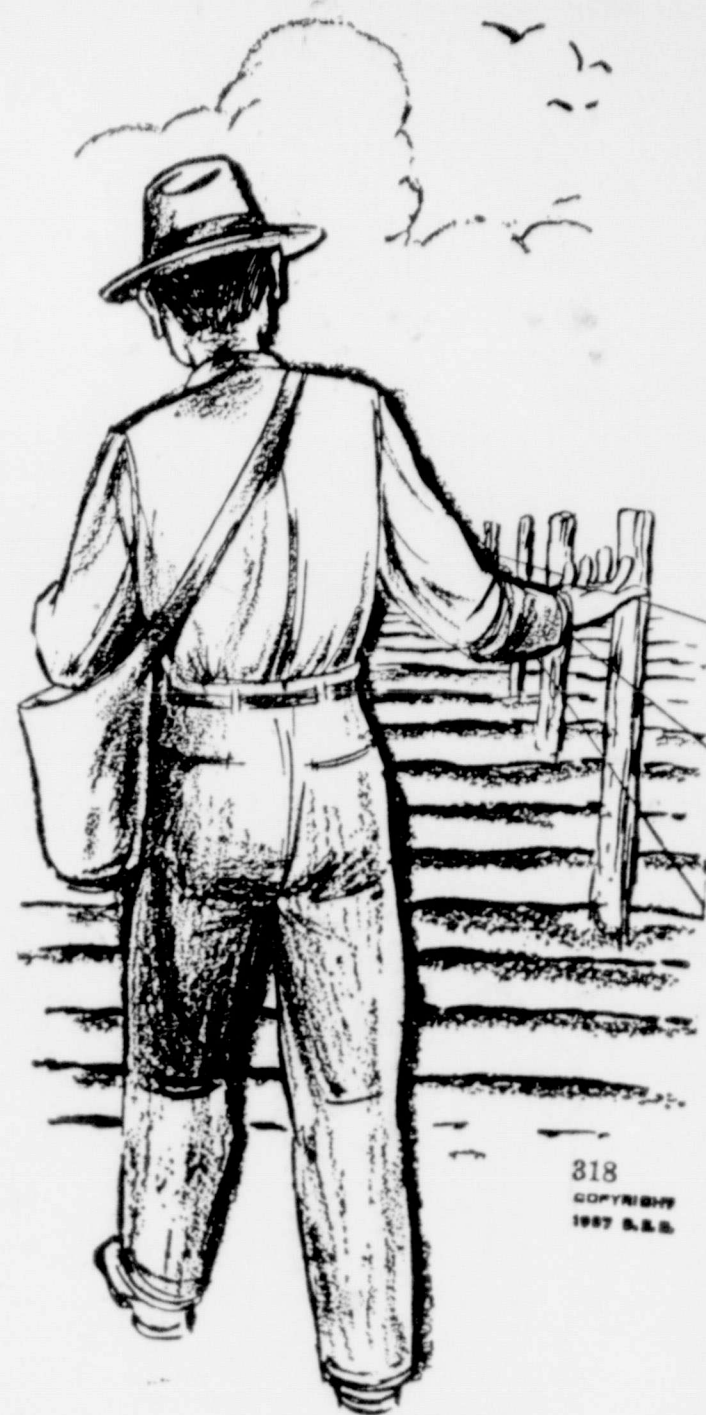
318

The homes we live in . . . the businesses and jobs which support us . . . the schools and churches which teach our children and enrich our lives . . . the convenient service establishments that supply our everyday needs . . . none of these were built, nor are they supported, by the dollars that are spent in some other community or city.