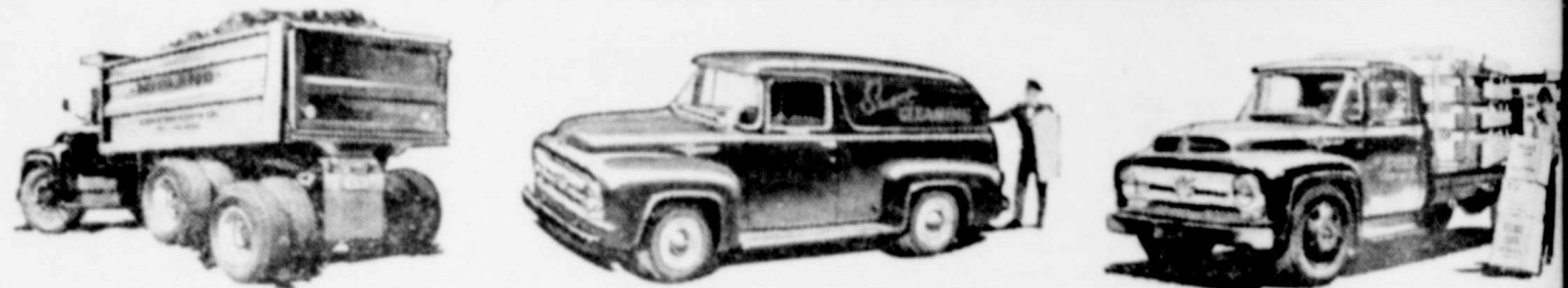
Ford tandem axle BIG JOBS are rated to carry more payload than comparable tandems of any of the leading manufacturers. T-800 model has max. GVW of 45,000 lb.—GVW is 45,000 lb.

DR. JOE E. WEBB OPTOMETRIST Rooms 306-308, Skaggs Building Telephone 4-6928 Plainview, Texas