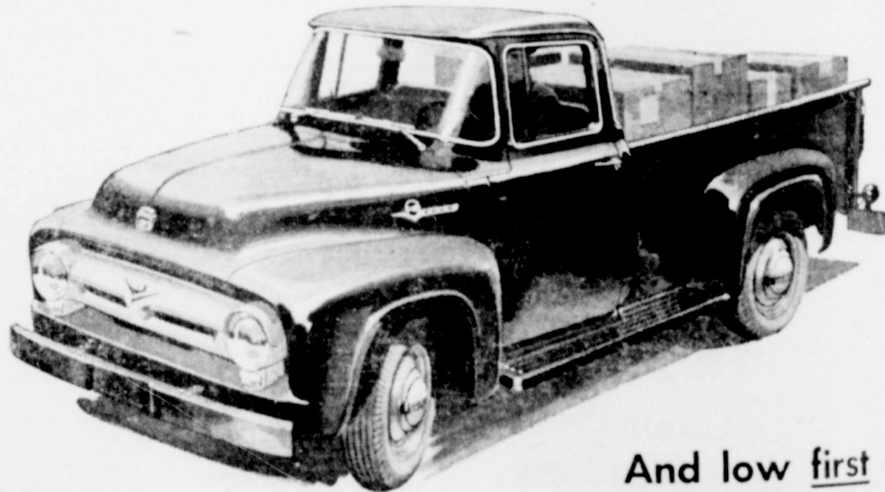
Ford's F-100 pickup with 6-ft. box is the biggest in the half-ton field—up to 19 cu. ft. more loadspace than the others. Regular 6 1/2-ft. box with a full 45 cu. ft. capacity also available.

And low first cost is only your first saving