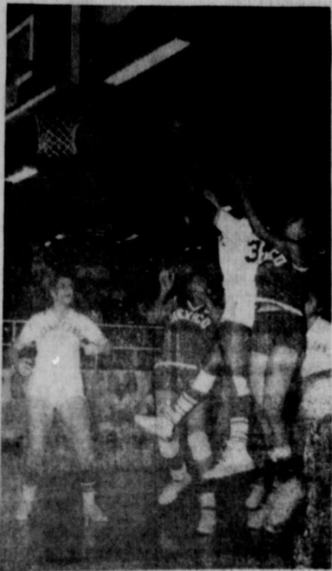
CAGE ACTION with an international flavor was the bonus this weekend in Ranger Junior College's Gym as the RJC Rangeanns hosted the Mexico Olympics, and in the first outing Friday night, triumphed over the South of the Border team, 51-49. The two teams were to have met Saturday night.