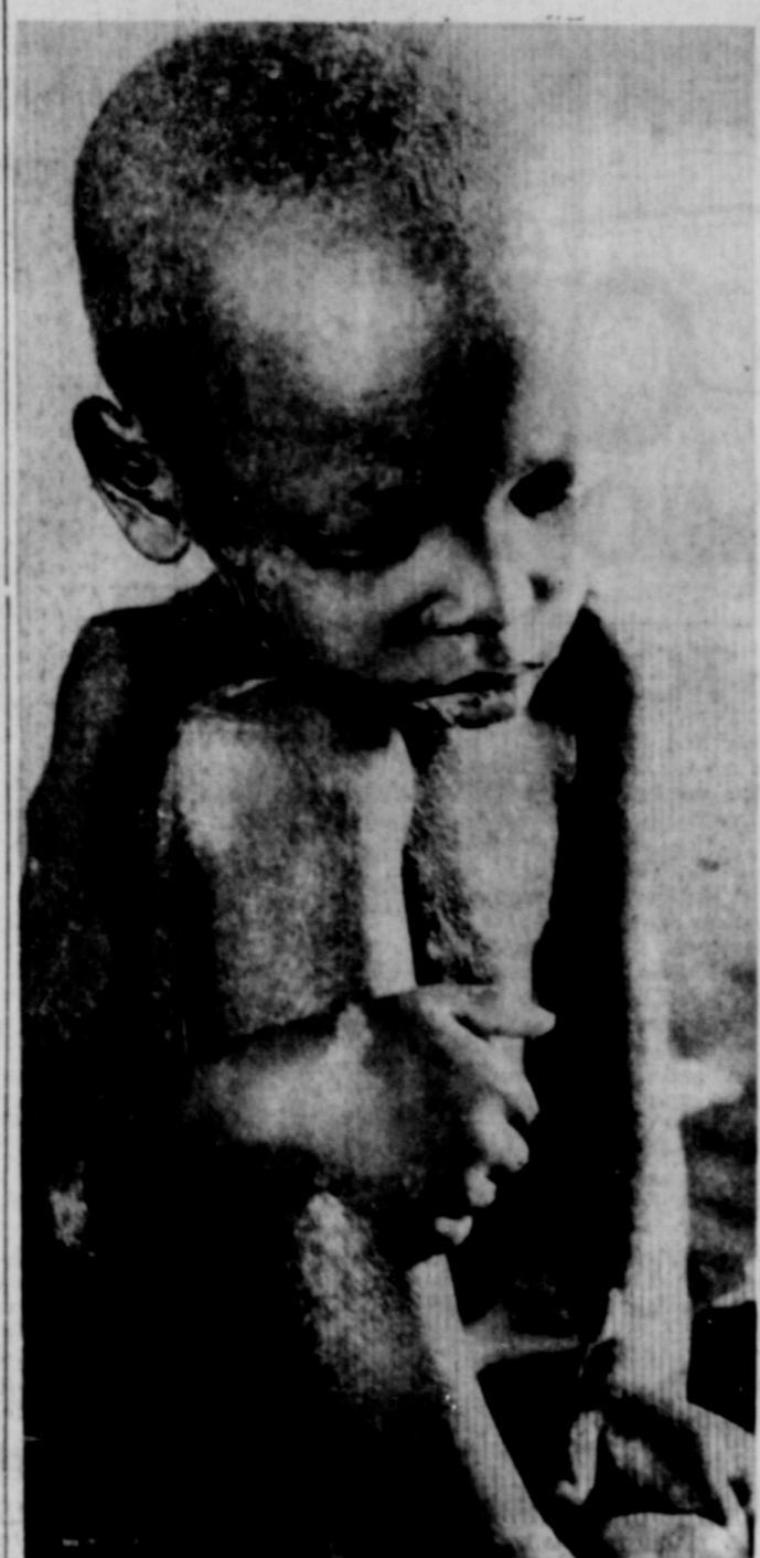
Emaciated and doomed Biafran child

Out-of-county judges will select the queen from the group. Girls will be judged on beauty, poise, and personality. The winner will be honored at a Queen's luncheon at noon Saturday at the White Elephant. She will also enter the state Pecan Queen contest to be held in July, 1970 in Dallas.